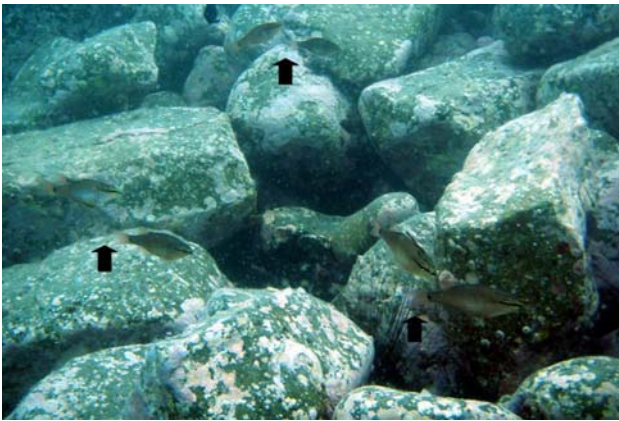
Fig. 1 Shallow boulder habitat of A. notatus at Morode Beach, Japan. There are three pairs (black arrows) in the photograph. See text for details

Apogon notatus (Pisces: Apogonidae) is a marine gregarious cardinalfish inhabiting the coastal waters of the northwestern Pacific. Female A. notatus start establishing their territories on a boulder bottom more than two months prior to the breeding season, and maintain their territories throughout the breeding season (Okuda 1999) (see Fig. 1). Females invite males shoaling above the boulder bottom to their territories to live in pairs for several weeks to months until spawning. After receiving a spawned egg mass in their buccal cavities, males leave the territories to mouthbrood in shoals. Female territorial behaviour is directed nearly exclusively towards potential egg predators (shoaling conspecifics) rather than towards mating competitors (Fukumori et al. 2009), suggesting that the primary function of the female territory is to avoid predation of the egg mass at the moment of spawning. After having several breeding cycles with different males, females abandon their territories in autumn to join large shoals in the water column (Okuda 1999). Thereafter, both males and females migrate to deep water to spend a couple of winter months there (Fukumori et al. 2008).