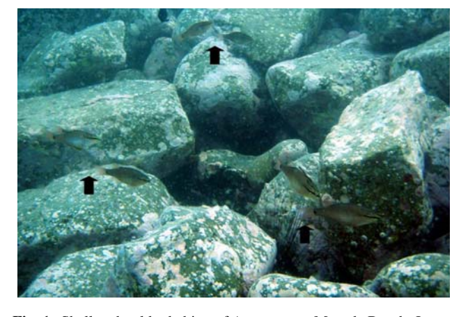
Fig. 1 Shallow boulder habitat of A. notatus at Morode Beach, Japan. There are three pairs ( black arrows ) in the photograph. See text for details

Apogon notatus (Pisces: Apogonidae) is a marine gregarious cardinalfish inhabiting the coastal waters of the northwestern Pacific. Female A. notatus start establishing their territories on a boulder bottom more than two months prior to the breeding season, and maintain their territories throughout the breeding season (Okuda 1999) (see Fig. 1). Females invite males shoaling above the boulder bottom to their territories to live in pairs for several weeks to months until spawning. After receiving a spawned egg mass in their buccal cavities, males leave the territories to mouthbrood in shoals. Female territorial behaviour is directed nearly exclusively towards potential egg predators (shoaling conspecifics) rather than towards mating competitors (Fukumori et al. 2009), suggesting that the primary function of the female territory is to avoid predation of the egg mass at the moment of spawning. After having several breeding cycles with different males, females abandon their territories in autumn to join large shoals in the water column (Okuda 1999). Thereafter, both males and females migrate to deep water to spend a couple of winter months there (Fukumori et al. 2008).