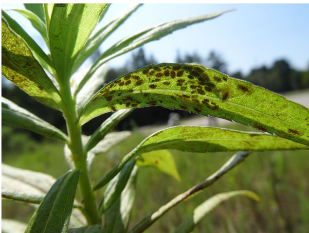
FIGURE 1 Lace bugs ( Corythucha marmorata ) feeding on Solidago altissima leaves

At the end of July, the number of leaves damaged by galls, mines, and chewing damage, excluding lace bug damage (which we term "other herbivore foliage damage") were recorded for each ramet. Lace bug herbivory can be distinguished from other insect herbivory by their yellow feeding scars. The level of lace bug damage was assessed by assigning the damaged leaves to four levels: (a) no damage, (b) <33% damage, (c) 33%–66% damage, and (d) >66% damage of total leaf area. Subsequently, we counted the number of leaves in each damage level, added the values of all four levels (which we term "lace bug damage"), and divided that with the total number of leaves to calculate the average damage value per leaf for each plant. For other herbivore foliage damage, we simply divided other herbivore foliage damage by the total number of leaves. We also counted the total number of leaves on all plants in each garden. For further analyses, we used these two values as resistance indices for herbivorous insects.