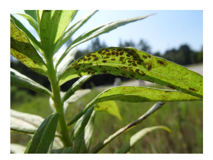
FIGURE 1 Lace bugs (Corythucha marmorata) feeding on Solidago altissima leaves

and introduced ranges, and (b) environments, which are reflected as the locations of the gardens, in its native and introduced ranges.